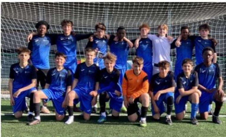
Year 9 Boys Football Team District Cup Winners 2026

A massive thank you to everyone that came to watch. Also thank you to the parents who provided lifts for some of the players to and from away matches.