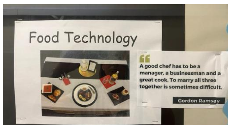
Posters displaying design technology and food technology departments in Bolton.