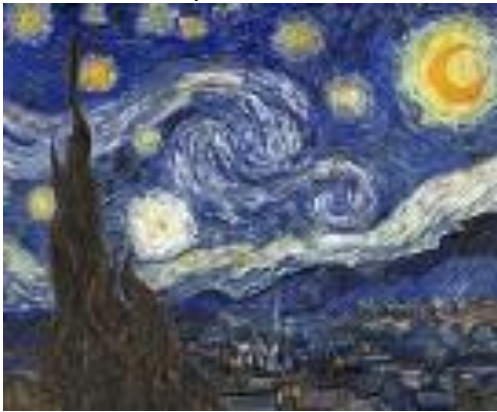
Van Gogh's The Starry Night (1889)

Er, well, there was a group of students who made a spiderweb out of string bigger than me and then asked me if I'd like to be the spider.